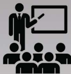
Faculty & Staff